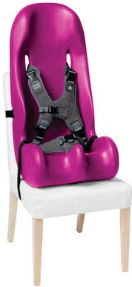
Attach to a chair

Sitters can be used in a variety of ways