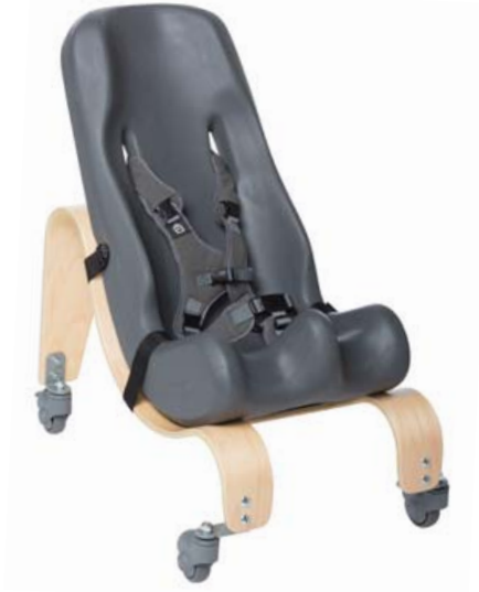
Sitter with Mobile Base