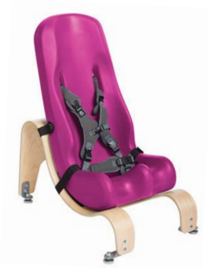
Sitter with Stationary Base