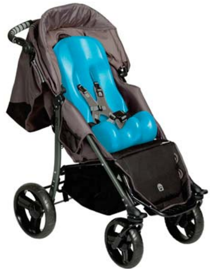
EIO Push Chair for Sizes 1,2