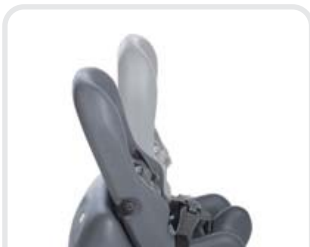
Sleek modern design provides up to 25° of tilt