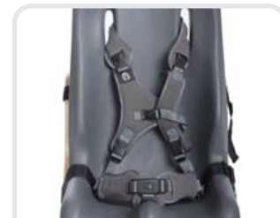
Adjustable 8-point harness