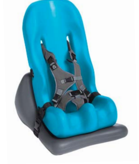
Floor Sitter Kit for Sizes 1,2,3