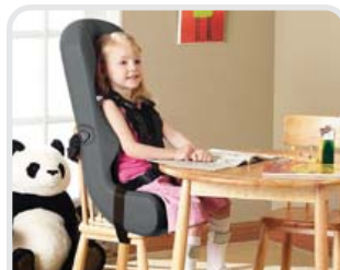
Attachment straps for securing to a standard chair