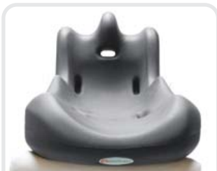
Contoured head and lateral support, shown as top view