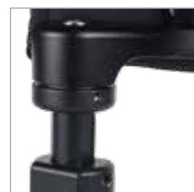
TT Series (Telescoping Taper) Power and Slot Mounting

Adjustable release lever position for removable style hardware fits user needs and preference.