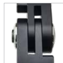
PT Series (Piano Taper) 2 Styles

Modular design which offers adjustability and customization so pad placement reaches exactly where needed, without compromise.