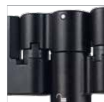
GT2 Series (Gear Tooth) 7 Mounting Options

Modular design with Swing-Away option. Winter/Summer available with Acta-Embrace® Back Support.