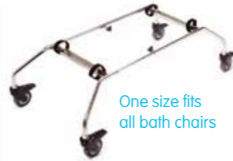
One size fits all bath chairs