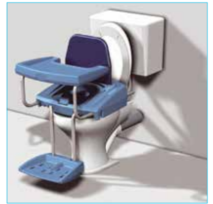
Over toilet seat

The seat can be simply removed from the standard toilet, as and when required.