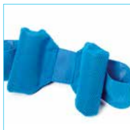
LAB/1/C Head support