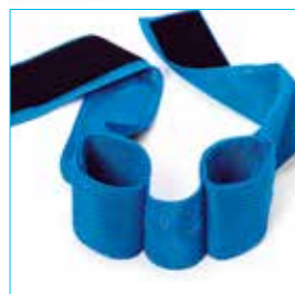
LAB/#/B Abduction Belt