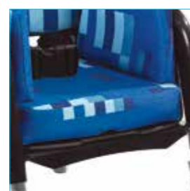
Seat pad for Easy Seat