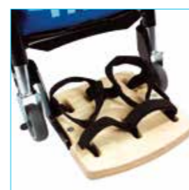
Footplate With sandal straps