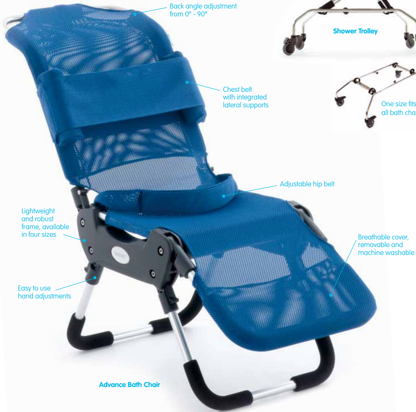
Advance Bath Chair