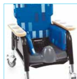
Potty insert for Easy Seat