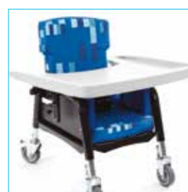
Height adjustable tray